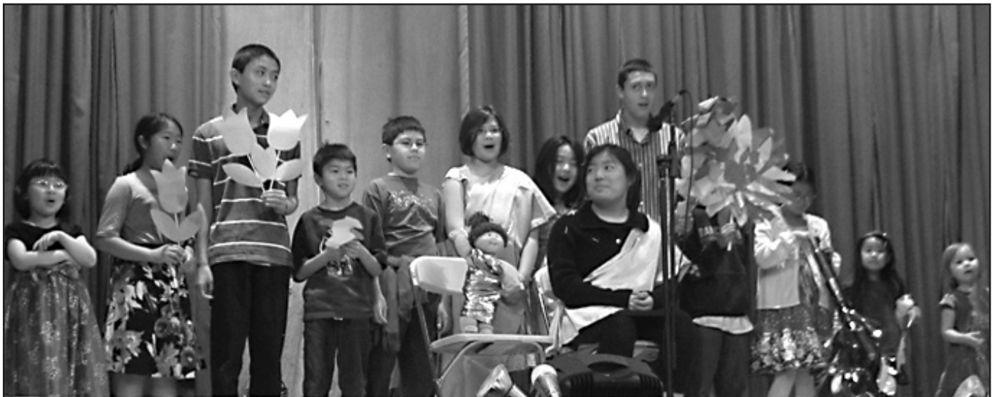
Dharma School Play