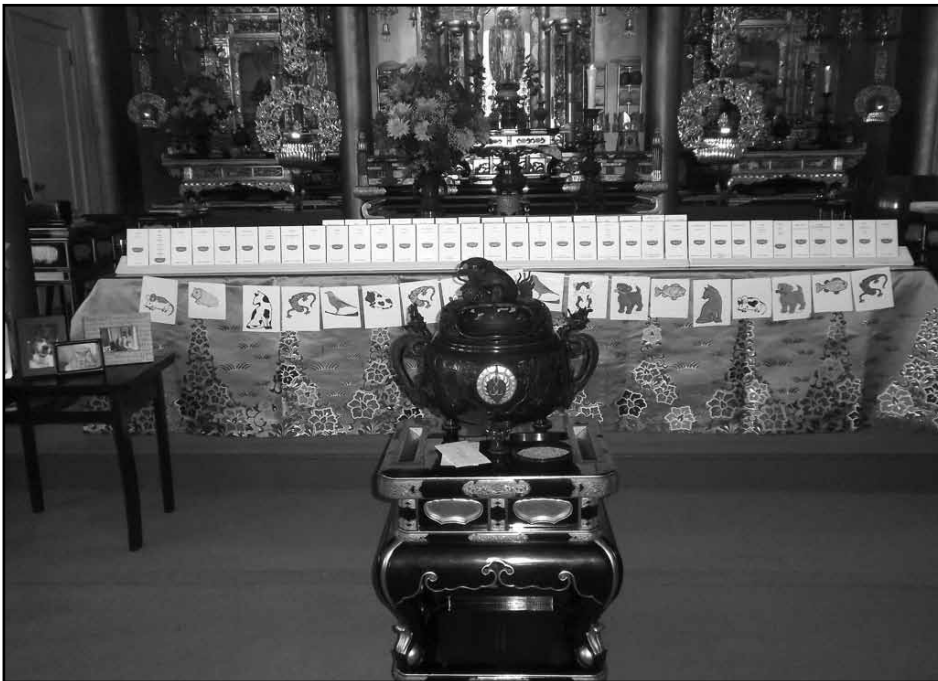
Pets Memorial Service

Everyone please enjoy your summer. Don't forget the Picnic July 15 and the Obon celebration August 4 and 5. ❀