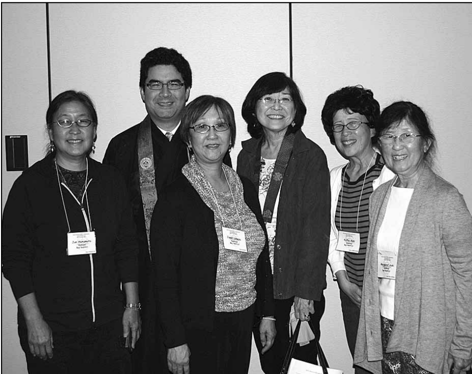
BCO teachers 61st FDSTL Conference