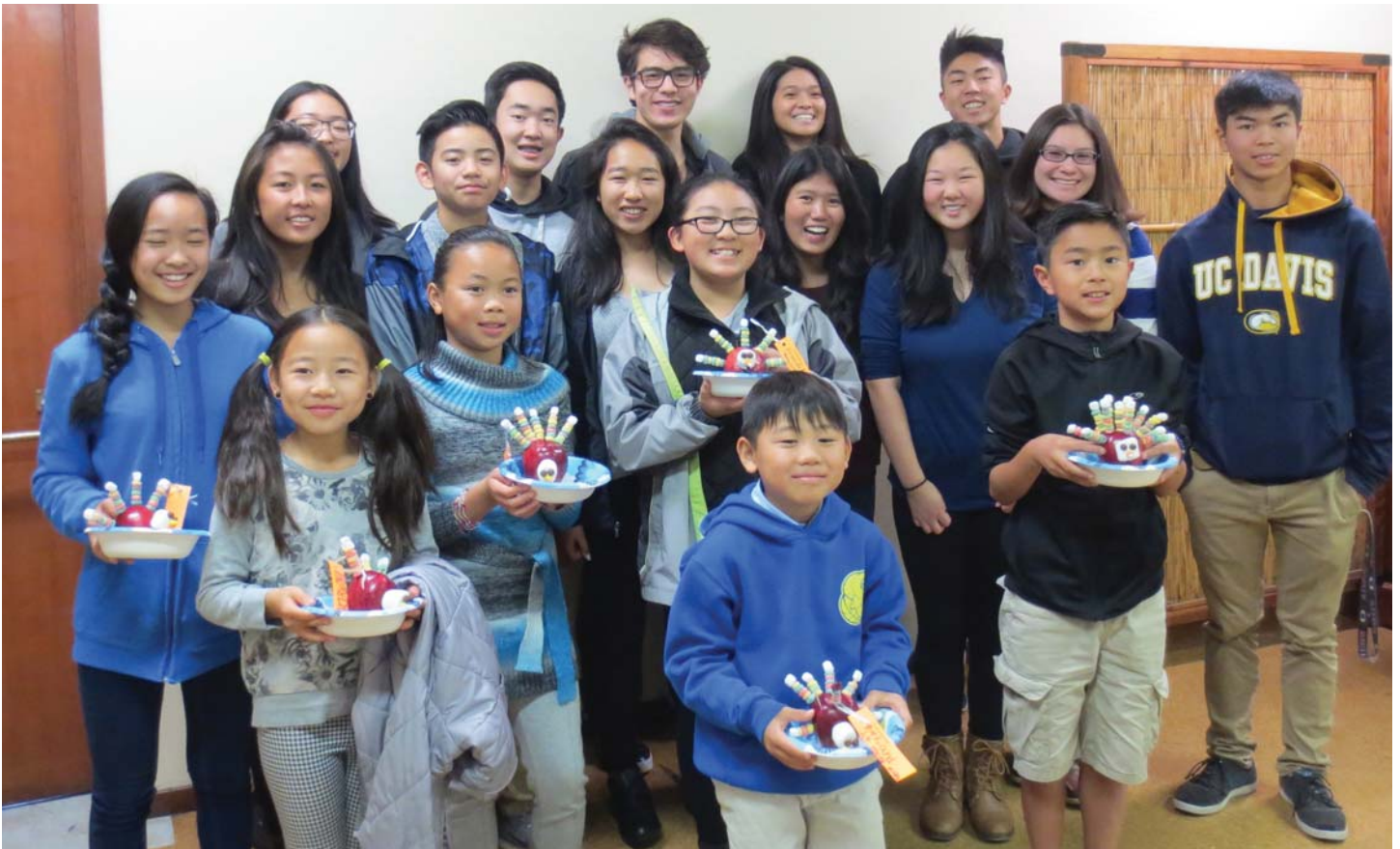
Dharma School Thanksgiving class 2017.

THANK YOU TO OUR WONDERFUL AND GENEROUS MEMBERS who brought toys for the Toy Drive. Our container of toys is getting to overflow and that is fantastic!!