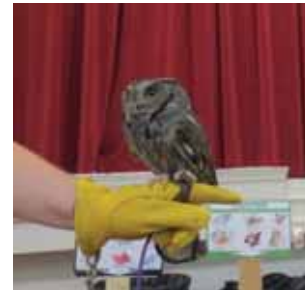
Look who came to visit