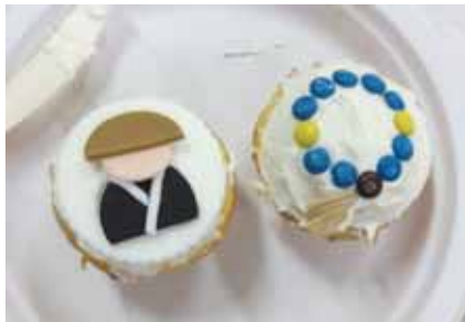
Edible Buddhist Lessons

We have classes, birthday celebrations, parties, skits, crafts, and games, all designed to teach us about Buddhism and help us lead a life of Nembutsu.