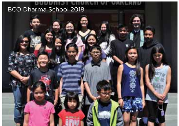
BCO Dharma School 2018