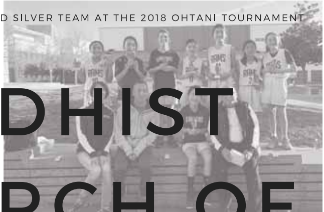
GIRLS D SILVER TEAM AT THE 2018 OHTANI TOURNAMENT

BUDDHIST CHURCH OF OAKLAND IS SEEKING BOYS AND GIRLS FOR THE 2018- 2019 BASKETBALL SEASON