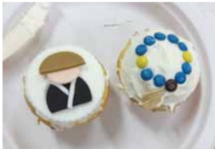
Edible Buddhist Lessons

We have classes, birthday celebrations, parties, skits, crafts, and games, all designed to teach us about Buddhism and help us lead a life of Nembutsu.