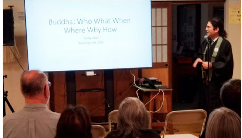
Study Class held on November 18th