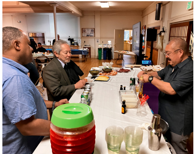
Following service and the Annual General Meeting on February 2 , the BCO Sangha held its annual New Year's luncheon and celebration! ■