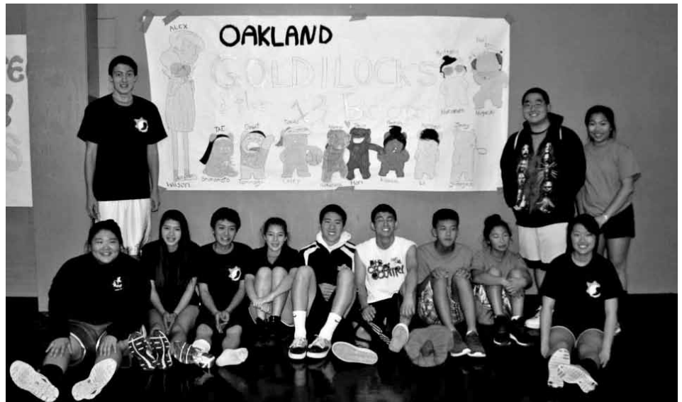
2012 Volleyball Tournament Champs